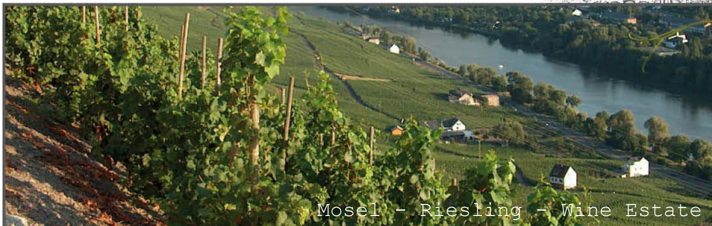
Mosel - Riesling - Wine Estate